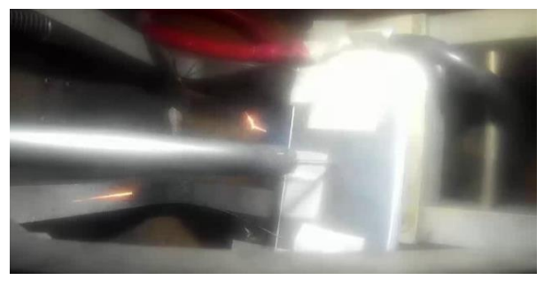
Figure 2. Nail penetration test on Lithium-ion pouch cell.

The development of safe battery cells and packs is of the outmost importance for a breakthrough in the electrification of transport and for using batteries in stationary storage. This is because an uncontrollable increase in temperature of the entire battery system (so-called thermal runaway) can cause an ignition or even explosion of the cell with simultaneous release of toxic gases. The causes and effects of a thermal runaway can be very diverse and complex (Figure 1). Either internal or external mechanical, operating or thermal stress leads to an internal heating of the cell that initiate different exothermal reactions, which lead to a further temperature and pressure increase. The final effects can be classified by the Hazard Level (1-7). Cell designs, component integrity, and manufacturing processes all have critical influence on the safety of Liion batteries [1]. To avoid thermal runaway, the system must be designed optimally on material, cell, pack and system level. In addition the battery and thermal management systems must be optimally designed for the technical and commercial requirements.