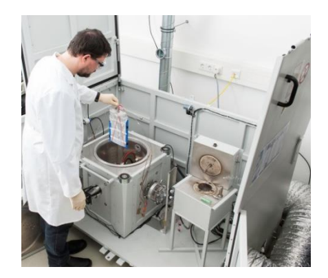
Figure 4. Two accelerating rate calorimeters (ARC) for safety testing of cells and packs.