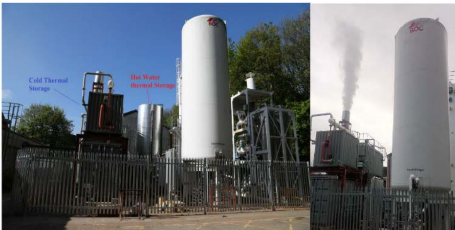
Figure 3. LAES Pilot plant at University of Birmingham.

Compared with other large scale energy storage technologies, LAES has the advantage of geographically unconstrained. This feature is particularly significant when coupling with existing processes is considered. The availability of cold makes it possible to effectively utilize various waste heat sources. The technology can also effectively use waste process cold from e.g. evaporation of LNG. Main barriers are associated with lack of commercial installations so far and policy related aspects. In the future, efforts should be made to enhance the round trip efficiency.